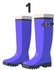
1 Rain Boots

Look at the pictures and write the words in Danish!