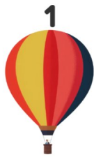
Hot Air Balloon

Look at the pictures and write the words in Danish!