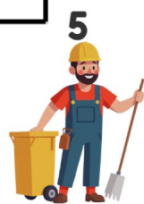
5 Sanitation Worker