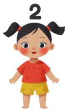
2 Baby Girl