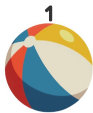
1 Beach Ball

Look at the pictures and write the words in German!