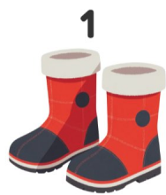
1 Snow Boots

Look at the pictures and write the words in Norwegian!