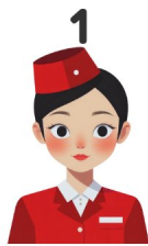
1 Flight Attendant

Look at the pictures and write the words in Norwegian!