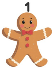
1 Gingerbread Man

Look at the pictures and write the words in Portuguese!