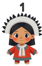
1 Native American

Look at the pictures and write the words in Portuguese!