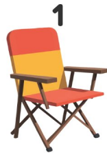
1 Camping Chair

Look at the pictures and write the words in Swedish!