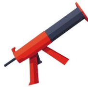
Pistola per silicone